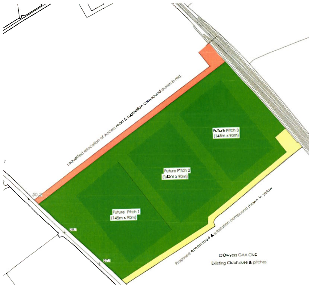
Figure A – Access road currently proposed (yellow) – requested relocation (red)

O'Dwyers welcome the proposal for the Dart+, in principle, as it will bring far more frequent trains to and from Balbriggan and we understand the need for associated infrastructure. As an important sporting organisation in Balbriggan we also must be prudent and plan for the future of our Club and its members and with Balbriggan continuously growing in population we respectfully request that Iarnrod Eireann in planning for increased capacity of public transport in Balbriggan and Dublin North, also assist O'Dwyers GAA Club in planning for increased membership and additional pitches in the future by moving the access road by a minimum of 200m northwards.