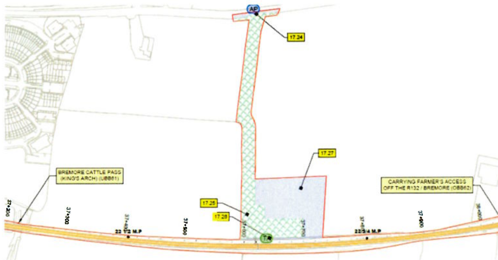
Extract from Works Layout Plan No.17

O'Dwyers will shortly be moving into our new clubhouse and grounds located at Bremore which are adjacent to the proposed access road (item no.17.24) for the electrical sub-station (item no.17.25)