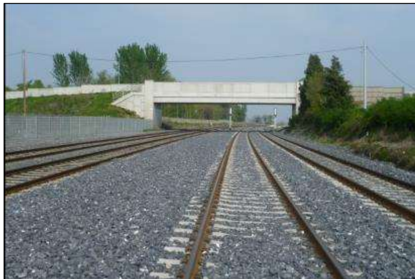
Figure 2-2 Four-tracking and Bridge Reconstruction (delivered as part of the Kildare Route Project)

Refer to Volume 4.5 Useful Links for a hyperlink to the Kildare Route Project Railway Order.