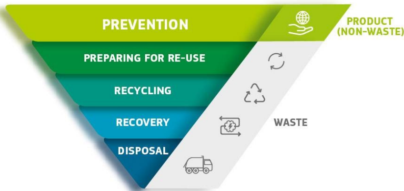
Figure 19-1 European Waste Hierarchy

Waste prevention is seen by the European Commission as the key factor in any waste management approach. If the arisings of waste can be reduced in the first place, or the use of dangerous substances in products reduced, then disposal automatically becomes simpler. Waste prevention is linked with improving manufacturing methods and influencing consumers to demand greener products and less packaging.