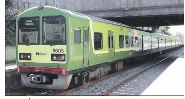
Iarnród Éireann last week commenced the second round of public consultation on DART+ West.

Funded by the National Transport Authority, under Project Ireland 2040, DART+ West is expected to provide a greatly enhanced and more sustainable transport option